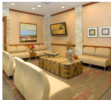
Our comfortable reception area

For more information on Breast Reconstruction options, please visit www.ParkMeadowsCosmeticSurgery.com or call (303) 706-1100 to schedule a consultation.